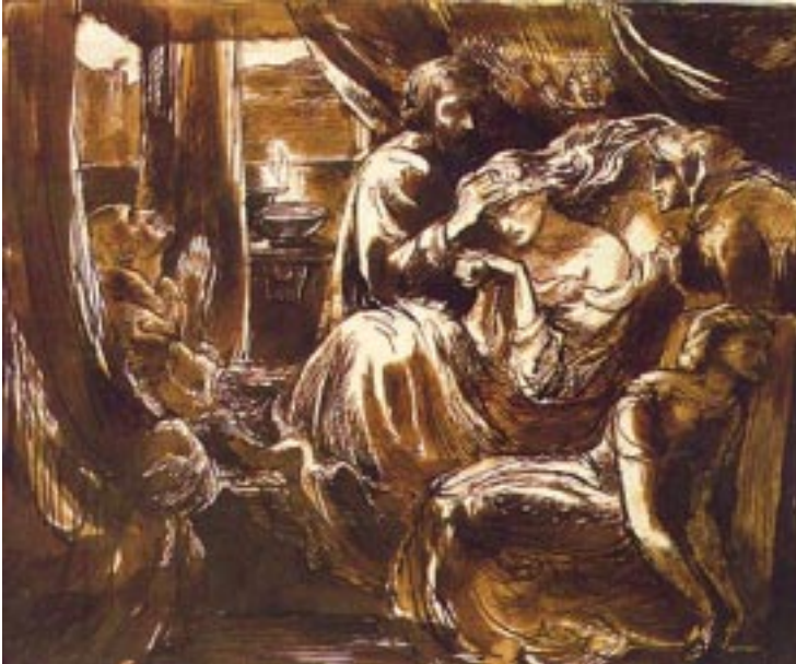
Dante Gabriel Rossetti. Study for the Death of Lady Macbeth.

LENNOX: And that well might Advise him to a caution, to hold what distance His wisdom can provide. Some holy angel Fly to the court of England and unfold His message ere he come, that a swift blessing May soon return to this our suffering country Under a hand accursed!